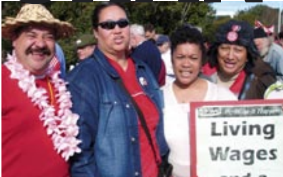
Above: North Shore Right: Chief of Chants Below: Waitakere make some noise!